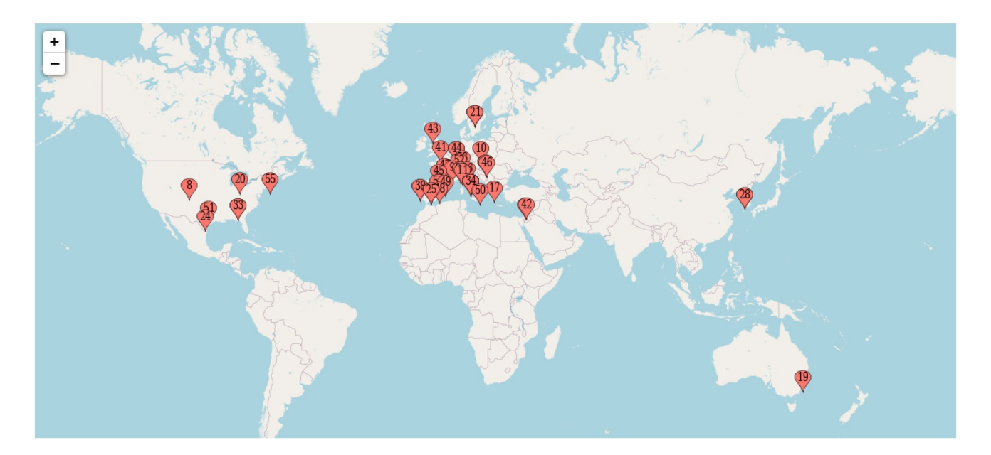
Fig. 1 Geographic distribution of the contributors

of the panel of experts, and two members of the steering committee (LMD and CL) coordinated and supervised the study activities.